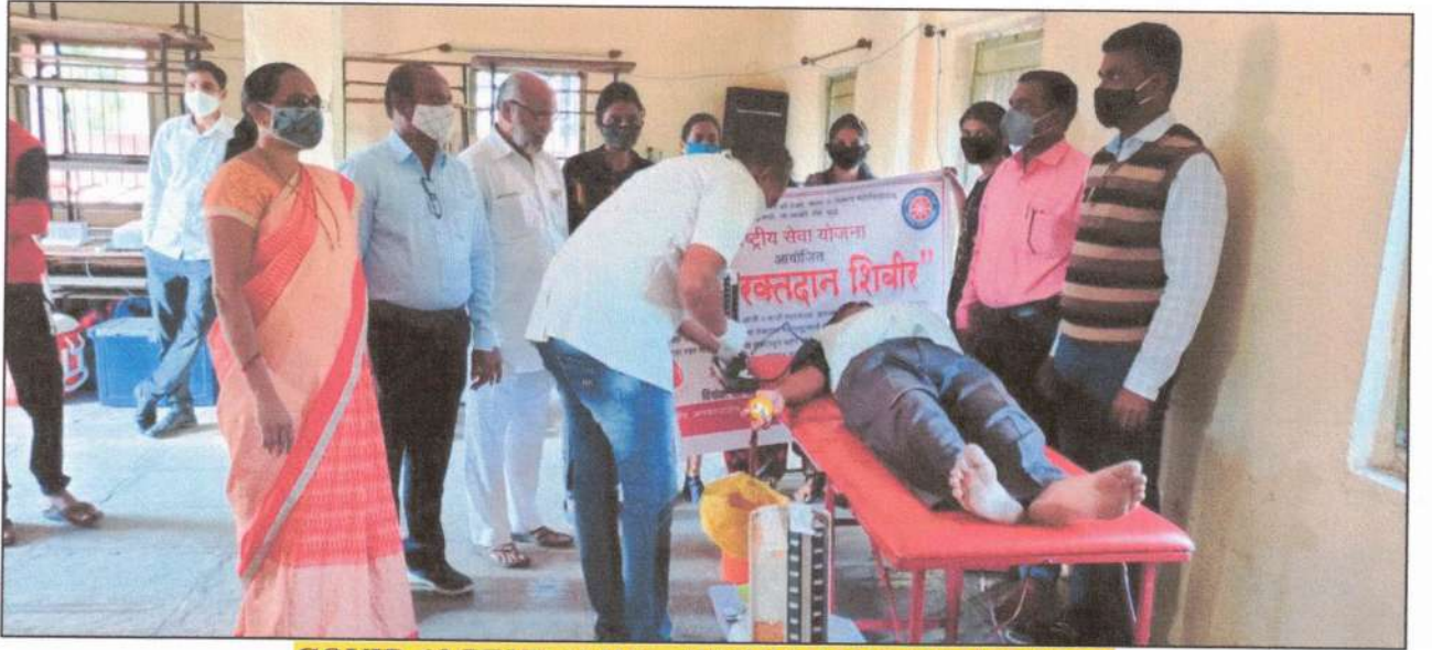
COVID-19 PENDAMIC – BLOOD DONATION CAMP