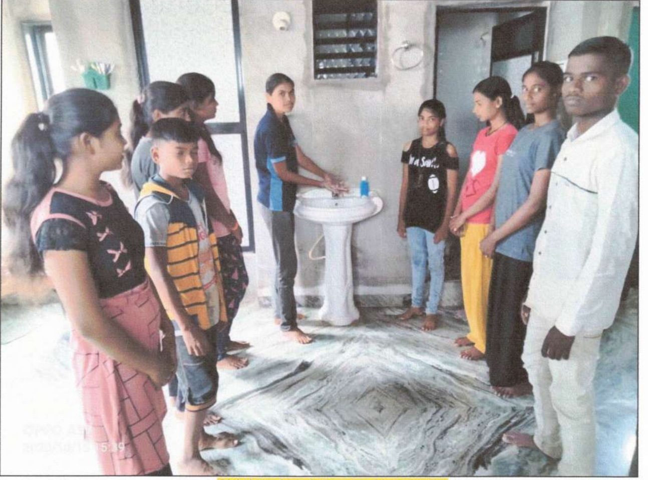
Global Hand Wash Day – Health Awareness