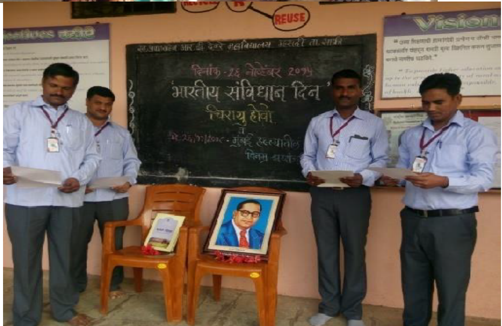
One Day Workshop on Human Rights Know our Constitution Programme-Jagar Sanidhanacha