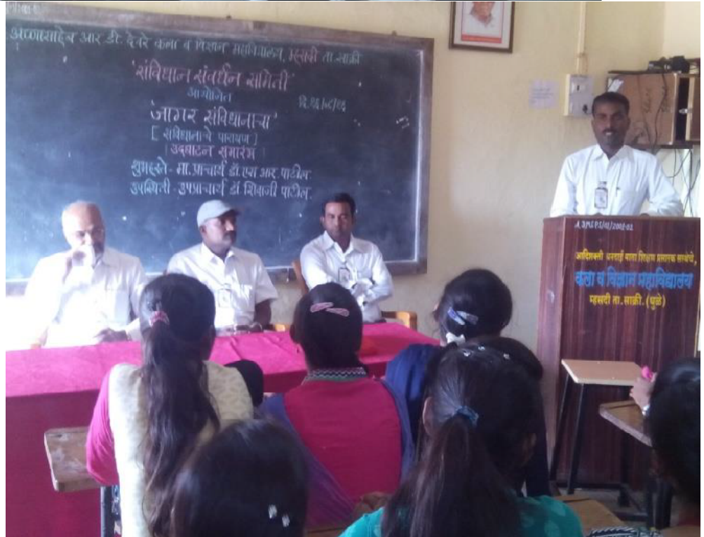
Arranged General Knowledge Exam.